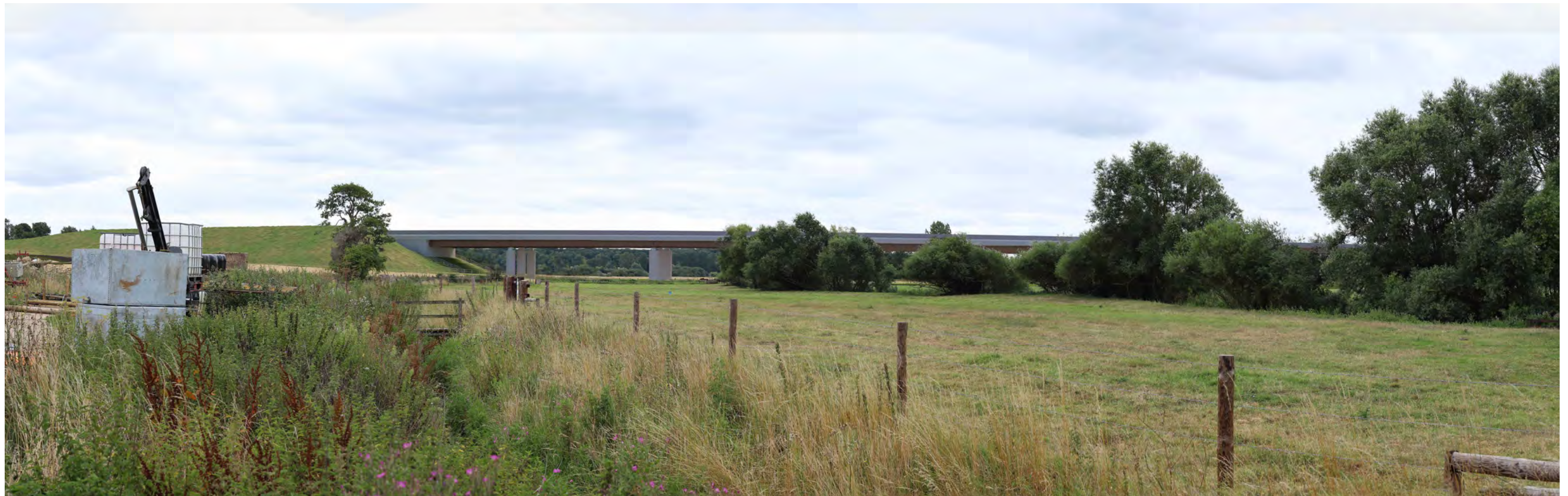
Zoom-in Extract, Recommended Viewing Distance at A3: 300mm