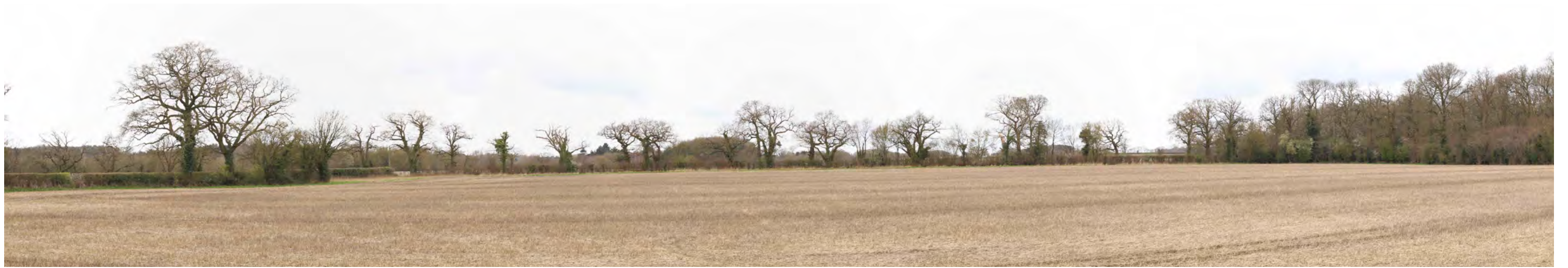
View 14: From Easton Estate, looking north-west