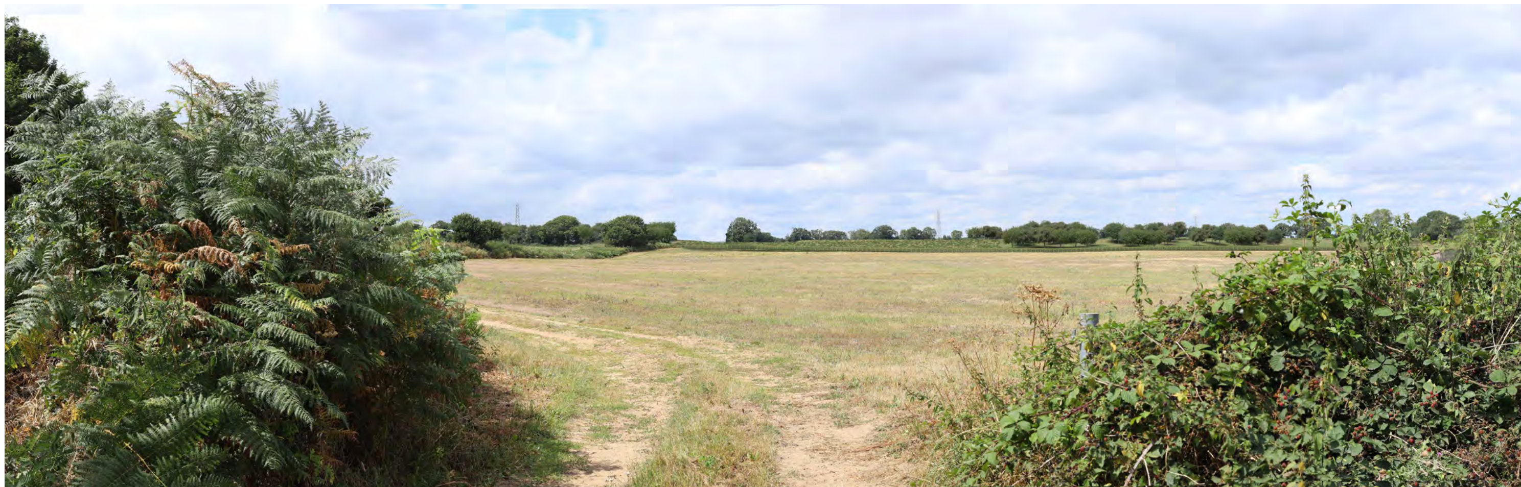
Zoom-in Extract, Recommended Viewing Distance at A3: 300mm