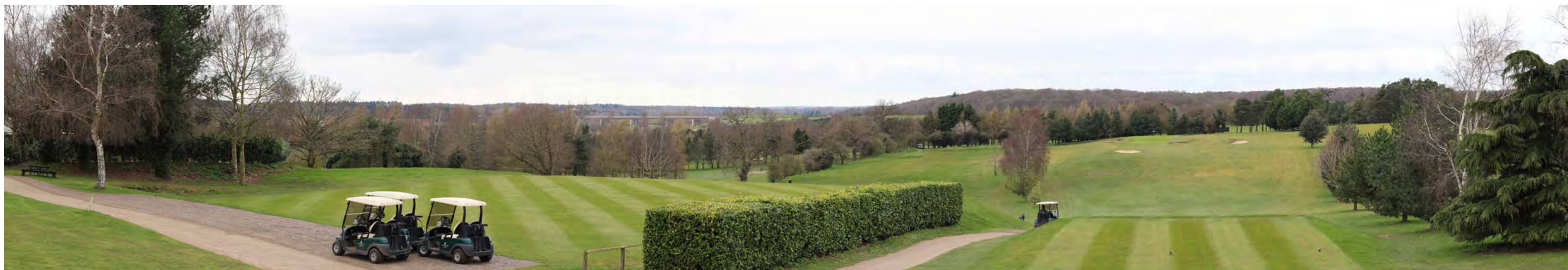
View 3: From Wensum Valley Hotel, Golf and Country Club, looking north