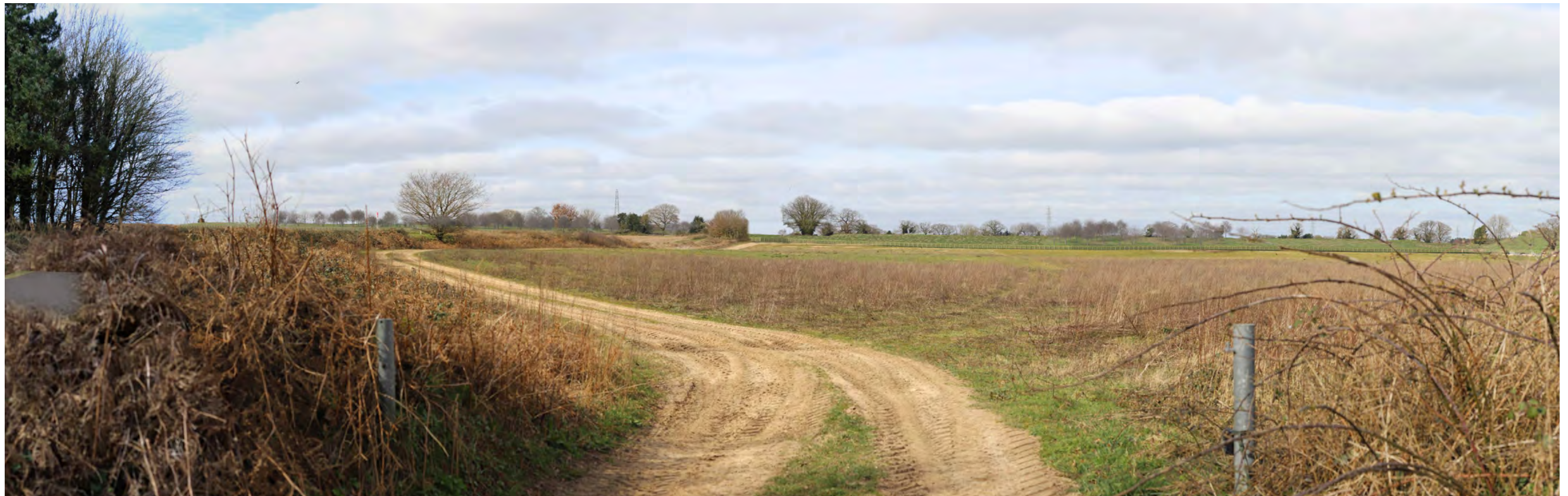
Zoom-in Extract, Recommended Viewing Distance at A3: 300mm