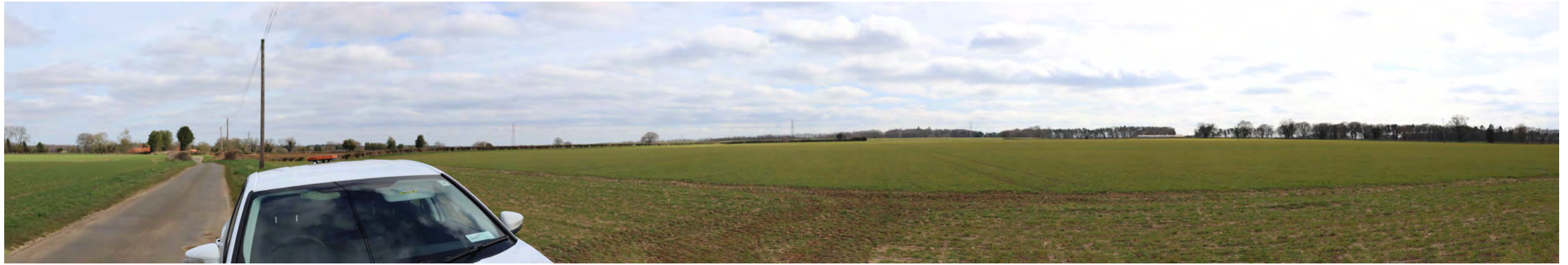
View 12: From Weston Green (Representative Viewpoint for Residential Properties in Weston Green), looking south