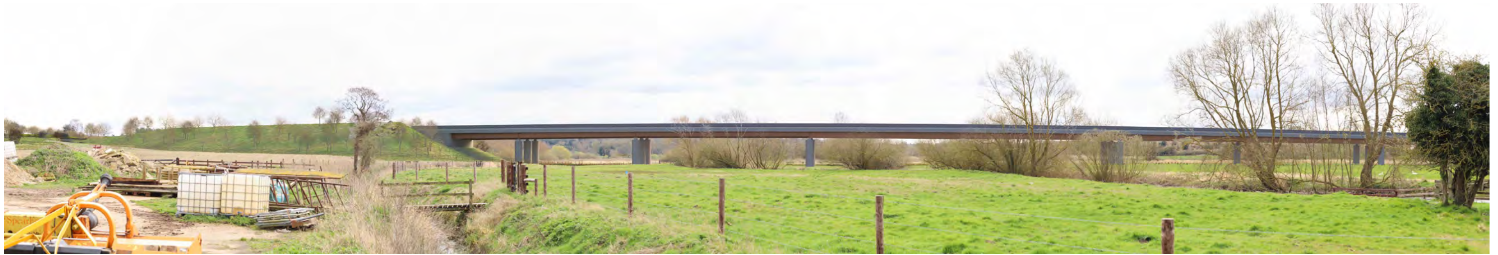
View 2: From Old Hall Farm on Fakenham Road, looking east