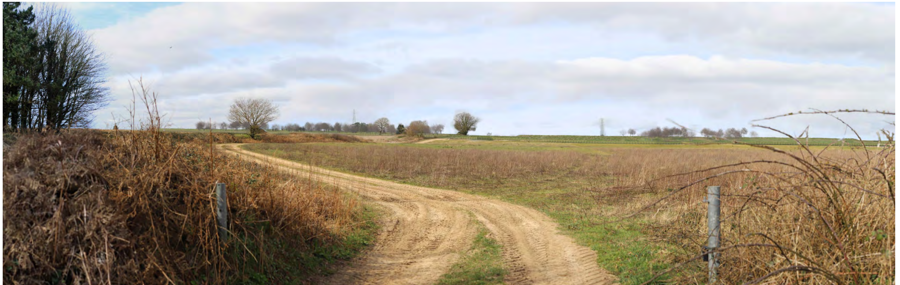
Zoom-in Extract, Recommended Viewing Distance at A3: 300mm