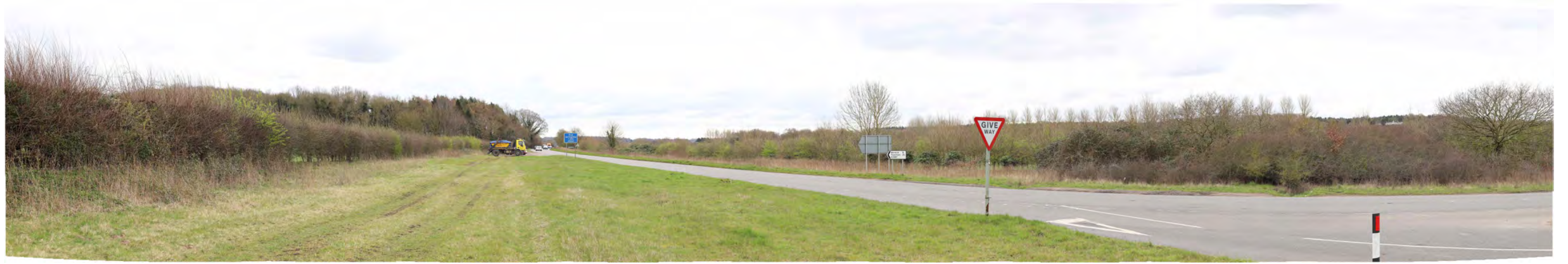
View 9: From A1067 Fakenham Road, looking south-east