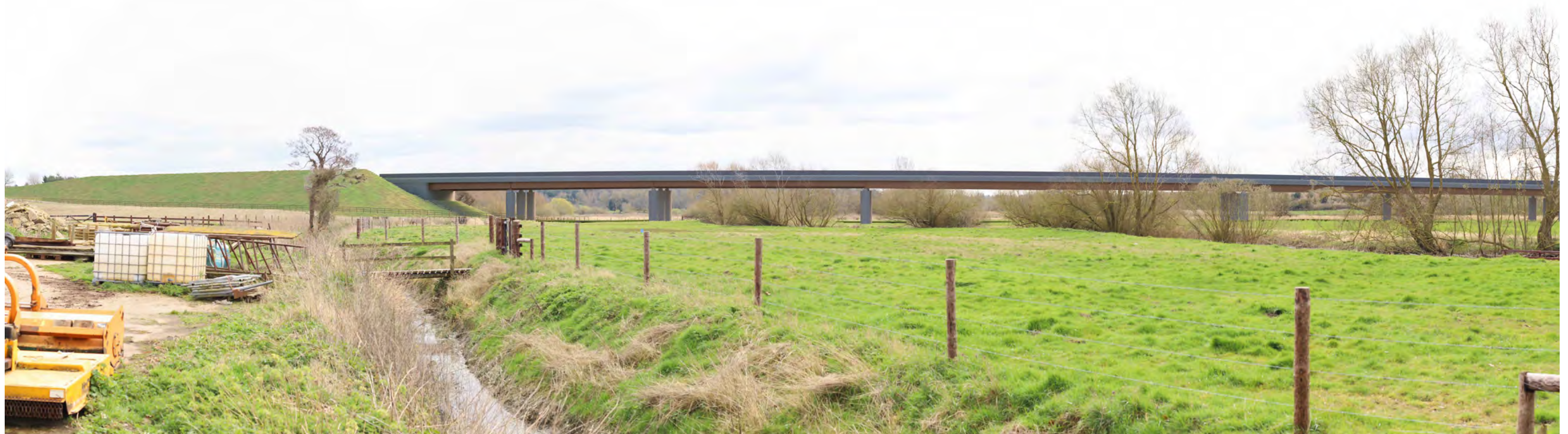
Zoom-in Extract, Recommended Viewing Distance at A3: 300mm