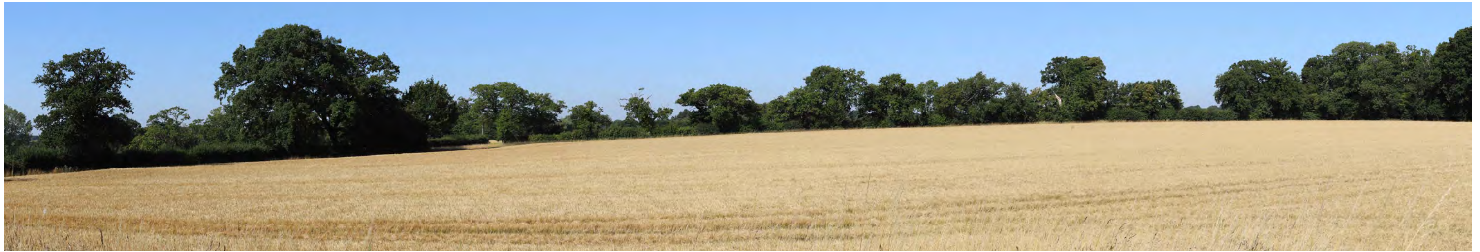
View 14: From Easton Estate, looking north-west