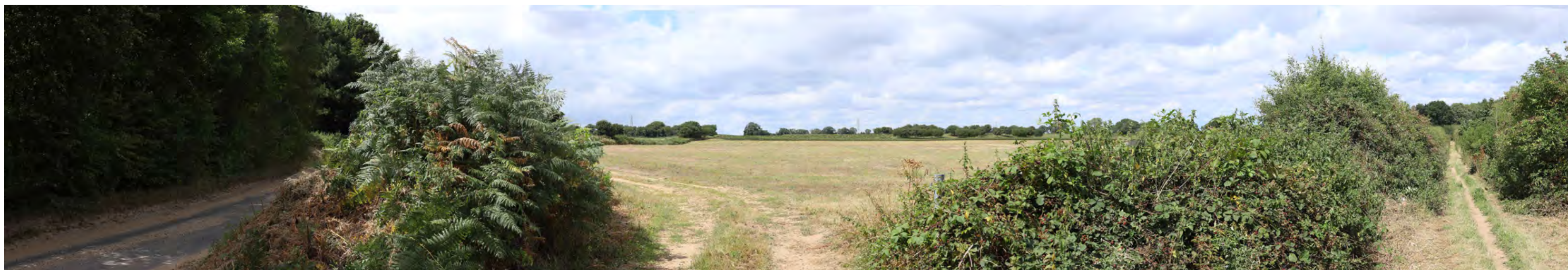
View 10: From Weston Road, looking north