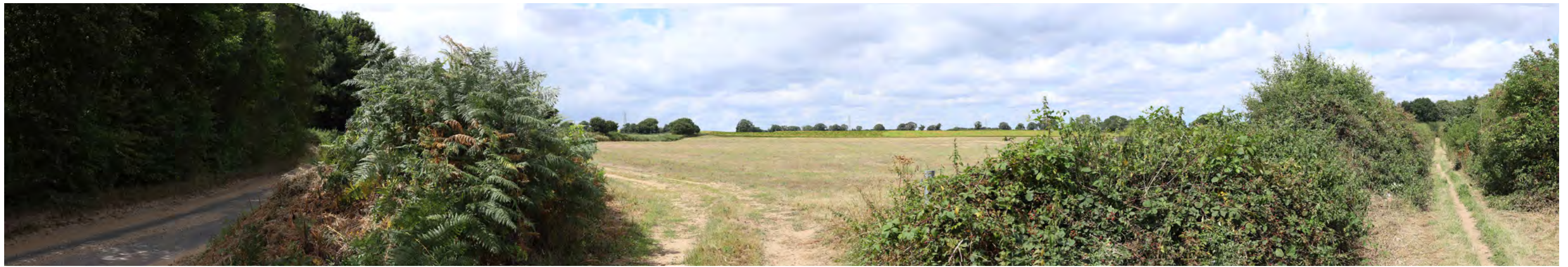
View 10: From Weston Road, looking north