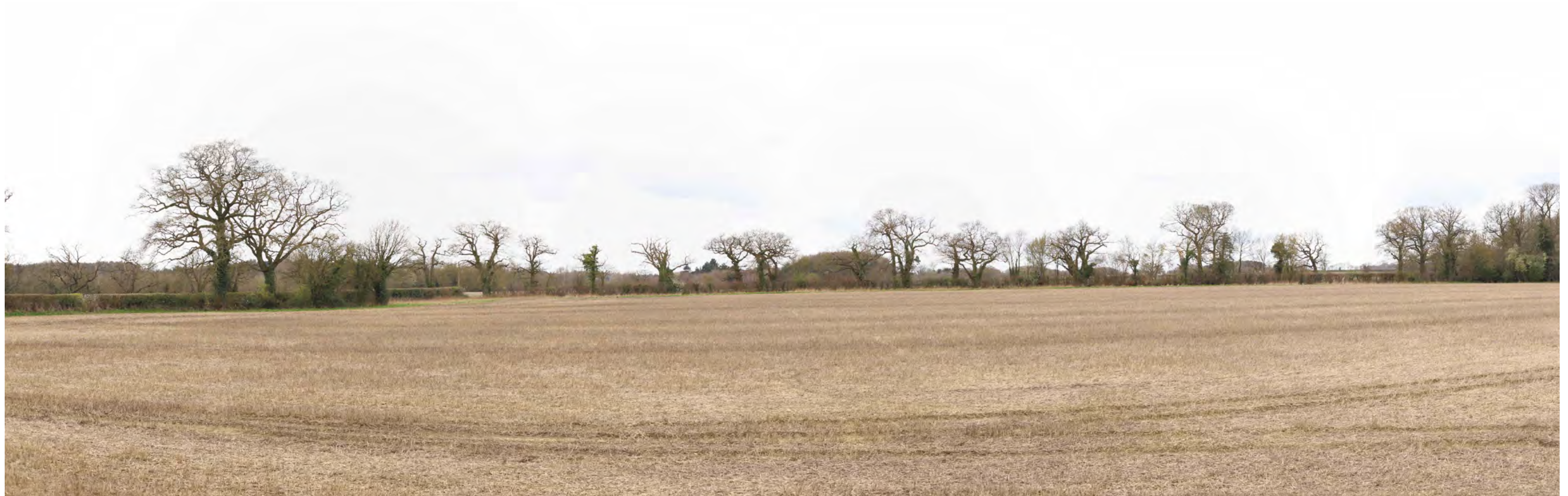
Zoom-in Extract, Recommended Viewing Distance at A3: 300mm