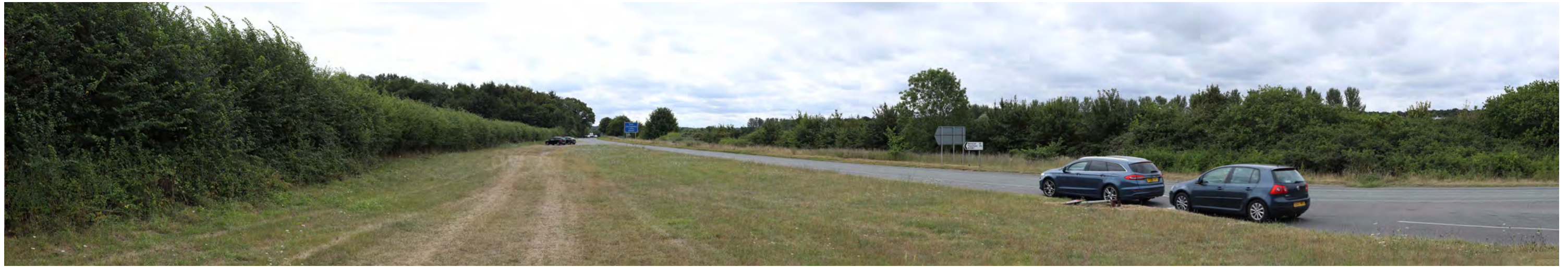
View 9: From A1067 Fakenham Road, looking south-east