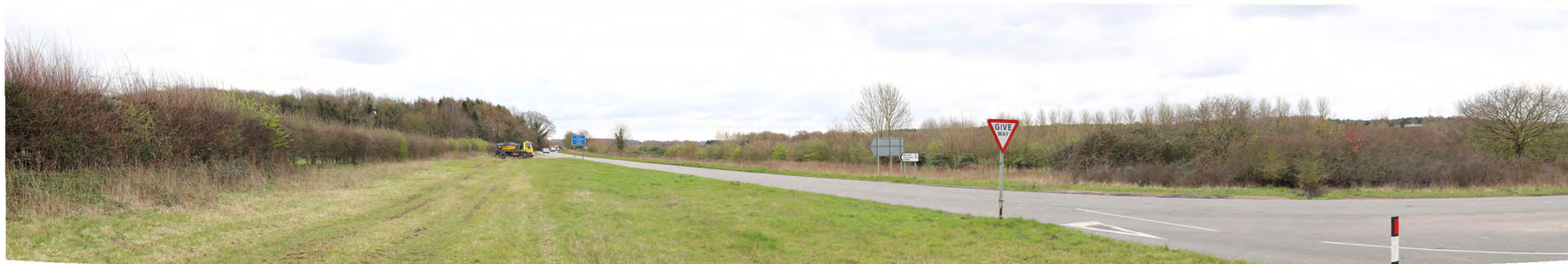
View 9: From A1067 Fakenham Road, looking south-east