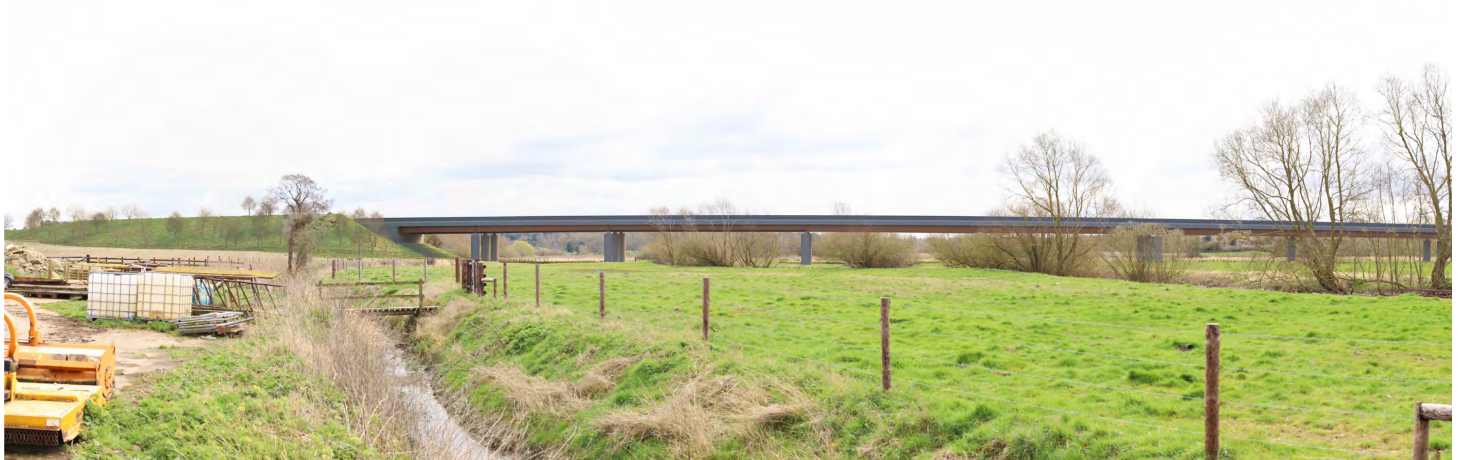
Zoom-in Extract, Recommended Viewing Distance at A3: 300mm