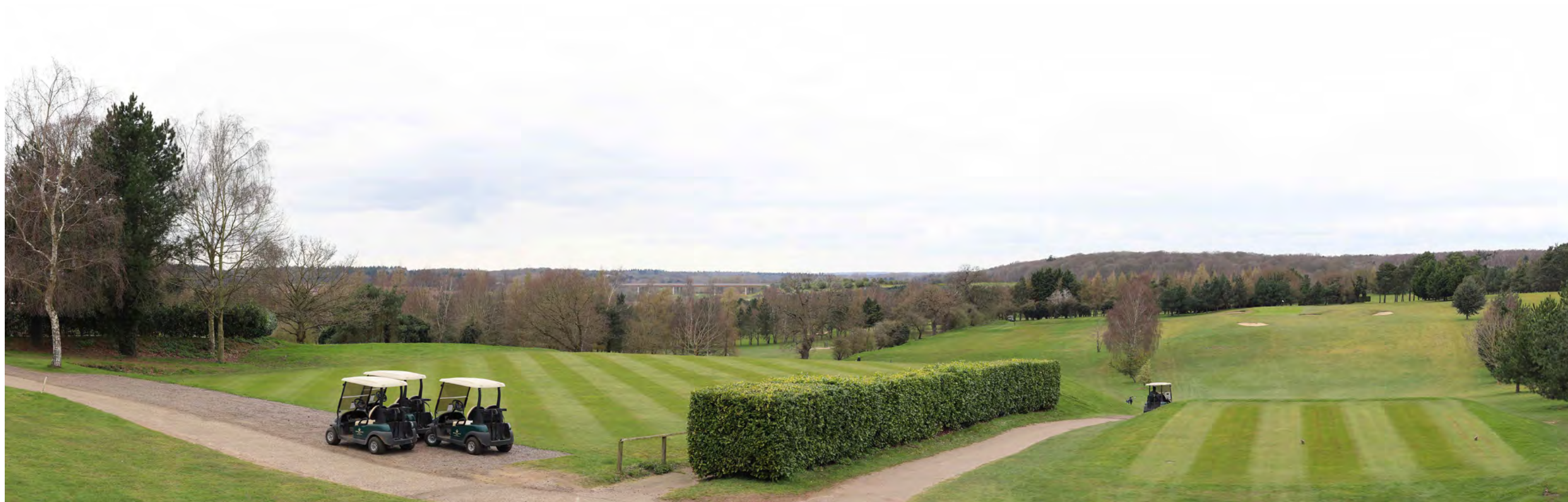
Zoom-in Extract, Recommended Viewing Distance at A3: 300mm