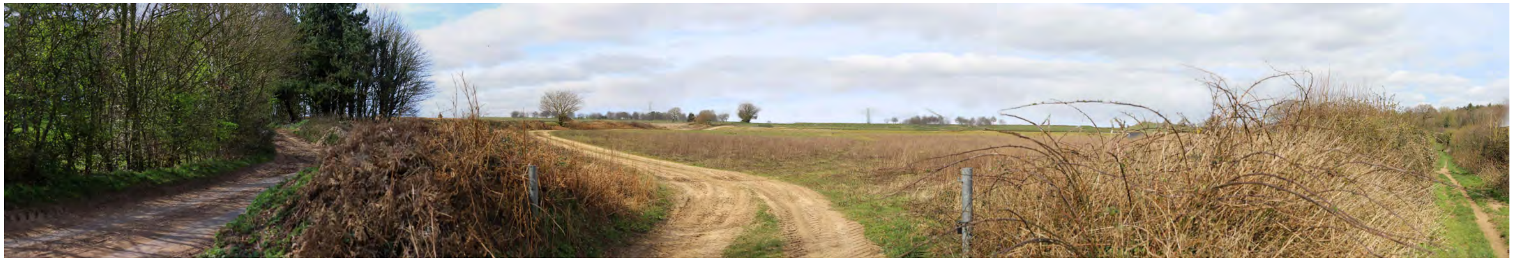
View 10: From Weston Road, looking north