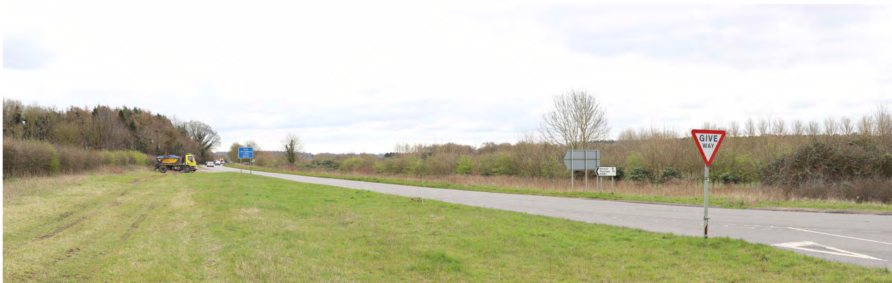
Zoom-in Extract, Recommended Viewing Distance at A3: 300mm