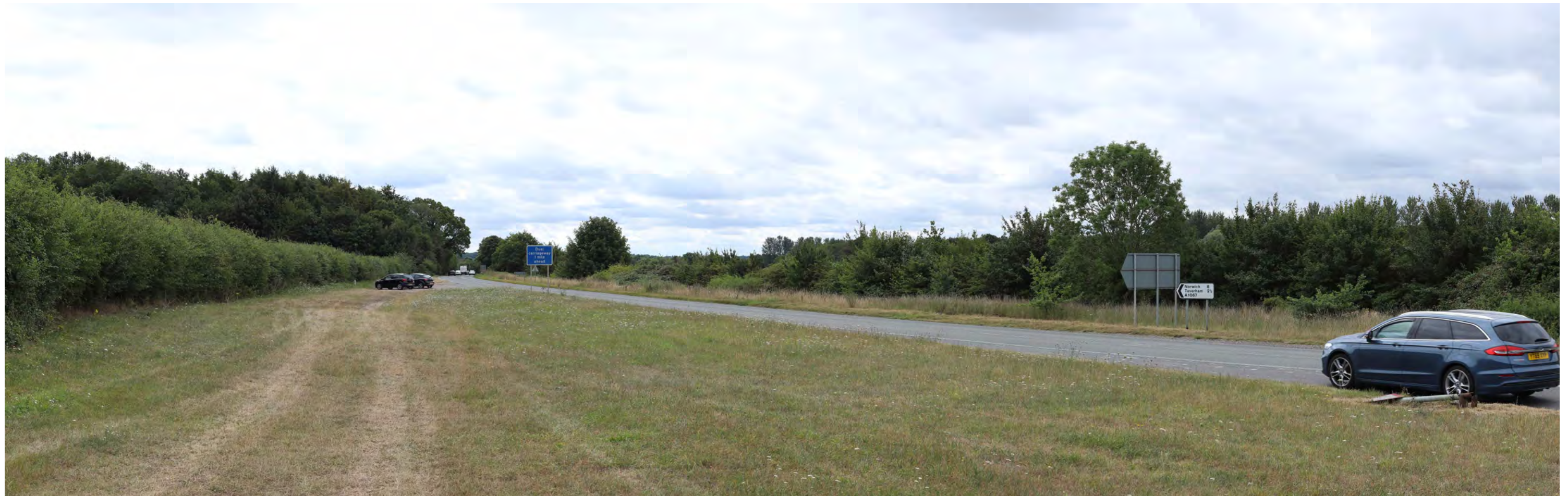
Zoom-in Extract, Recommended Viewing Distance at A3: 300mm