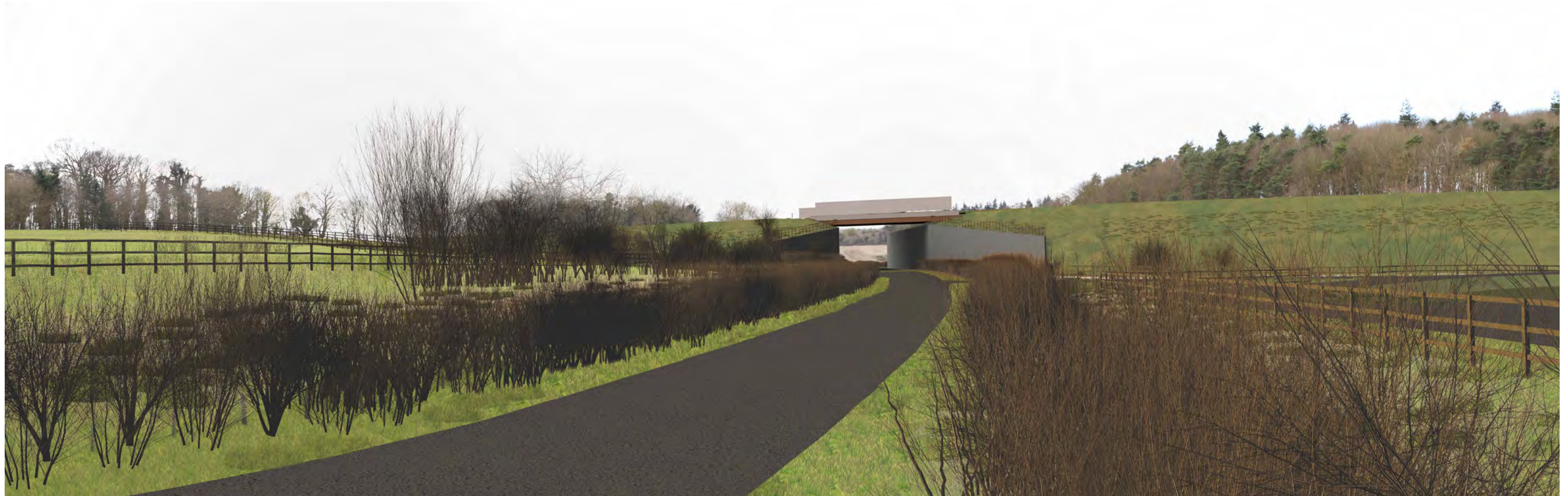
Zoom-in Extract, Recommended Viewing Distance at A3: 300mm