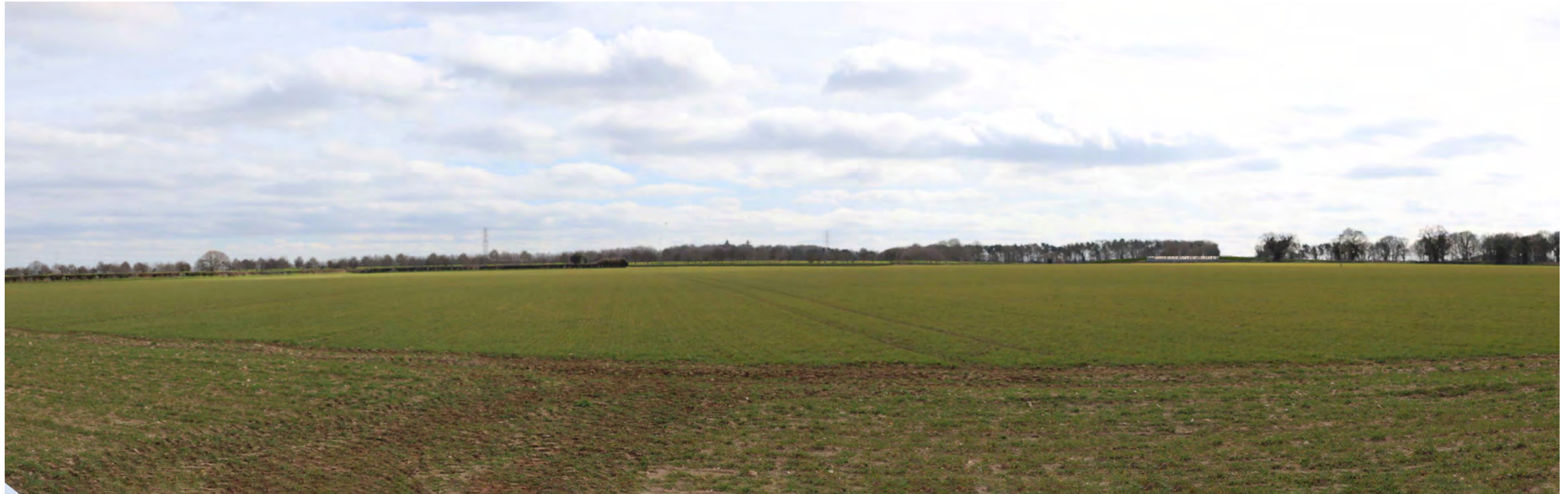
Zoom-in Extract, Recommended Viewing Distance at A3: 300mm