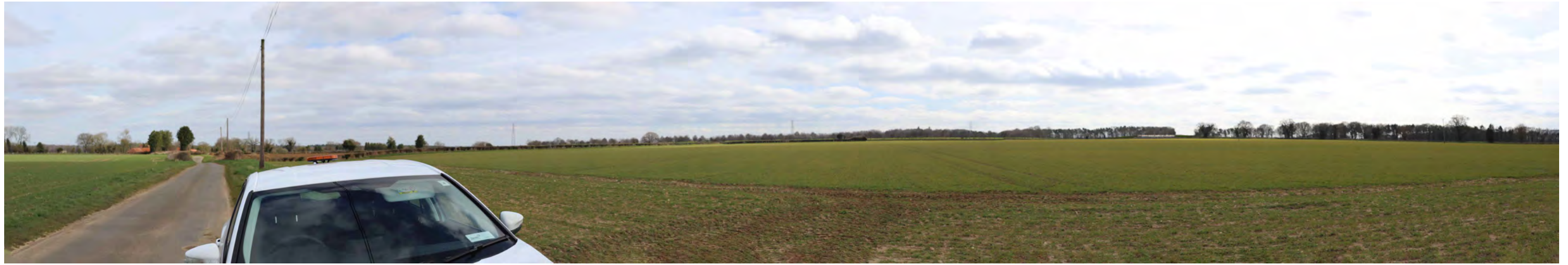
View 12: From Weston Green (Representative Viewpoint for Residential Properties in Weston Green), looking south