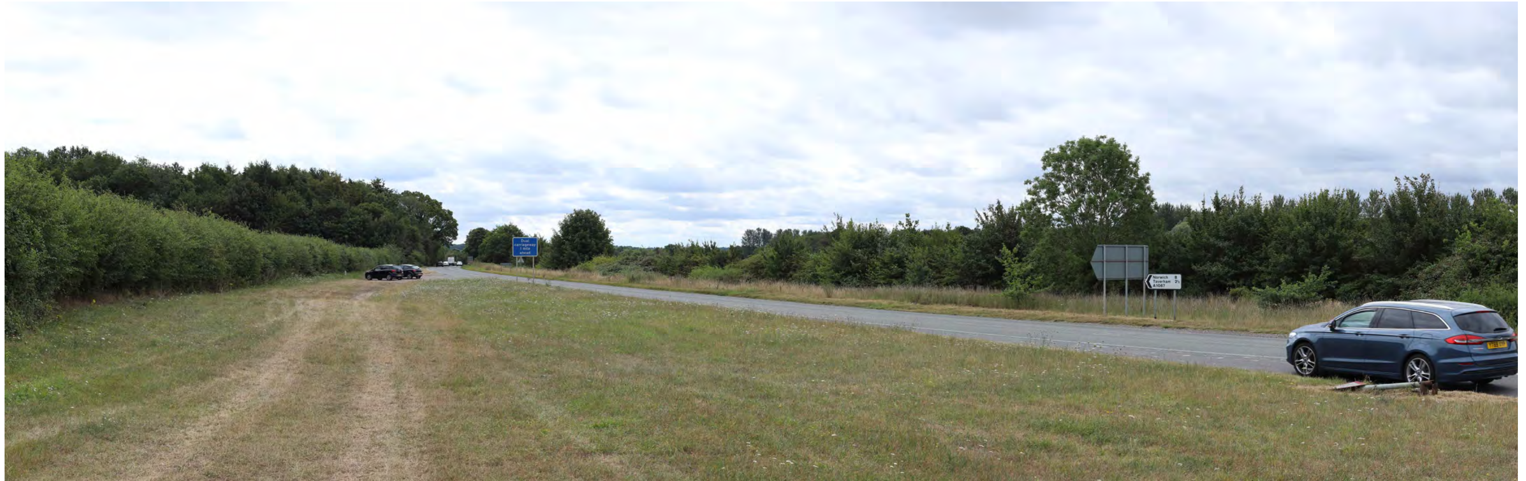
Zoom-in Extract, Recommended Viewing Distance at A3: 300mm