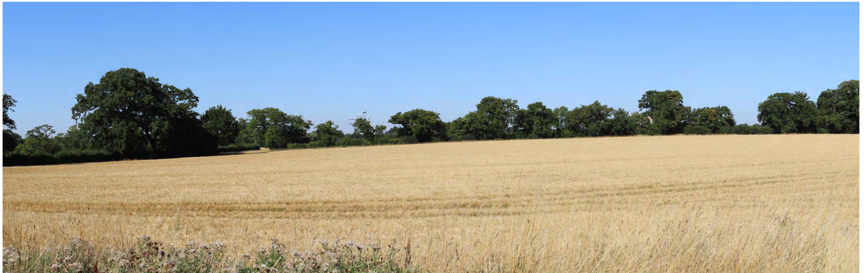
Zoom-in Extract, Recommended Viewing Distance at A3: 300mm