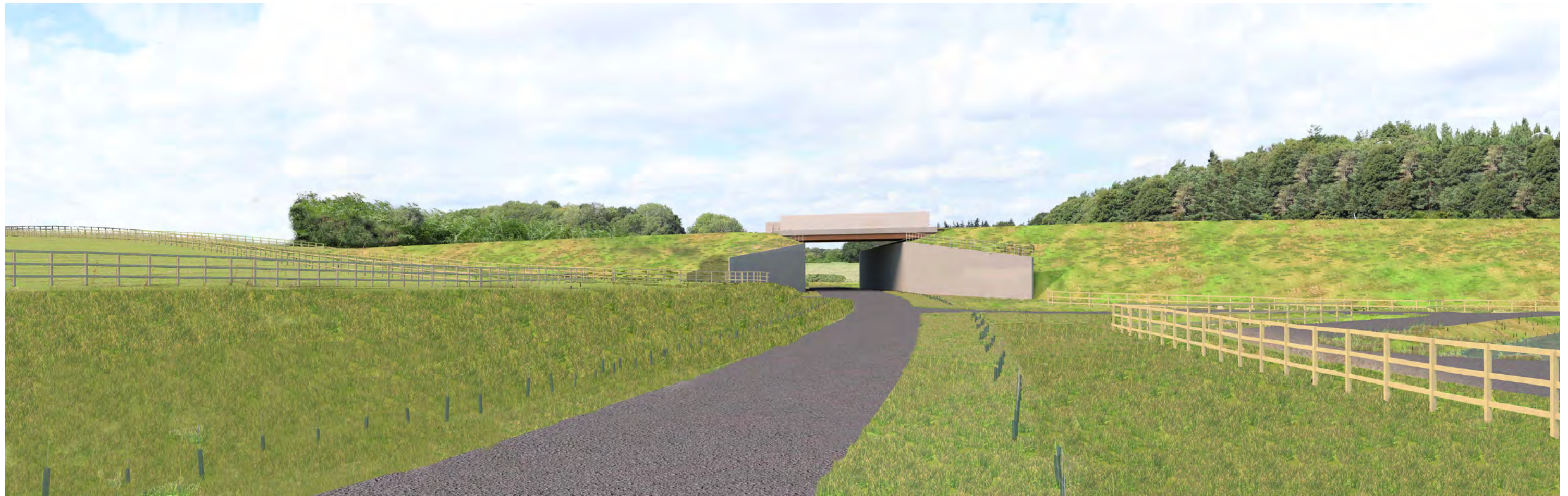
Zoom-in Extract, Recommended Viewing Distance at A3: 300mm