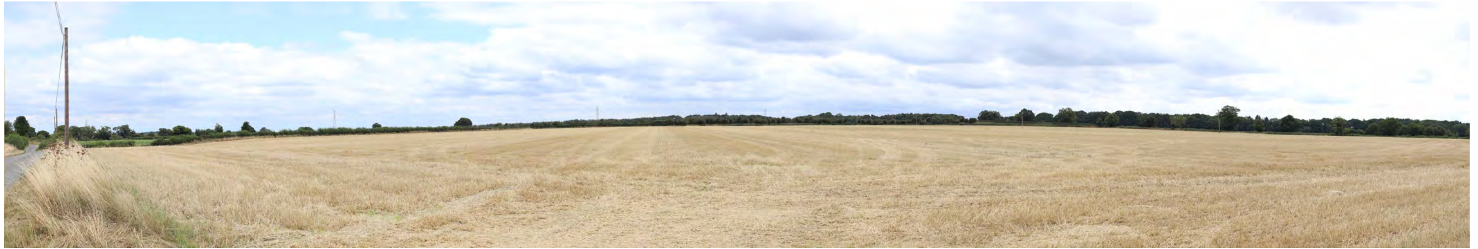
View 12: From Weston Green (Representative Viewpoint for Residential Properties in Weston Green), looking south