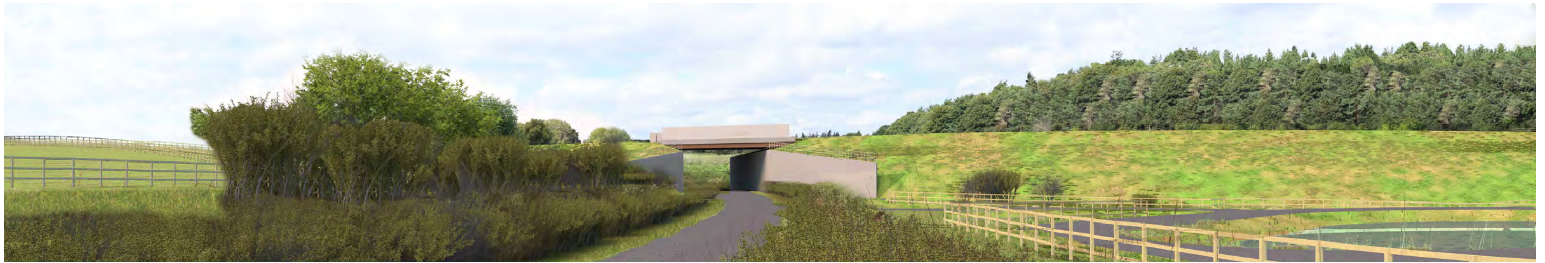
View 5: From Ringland Lane, looking west