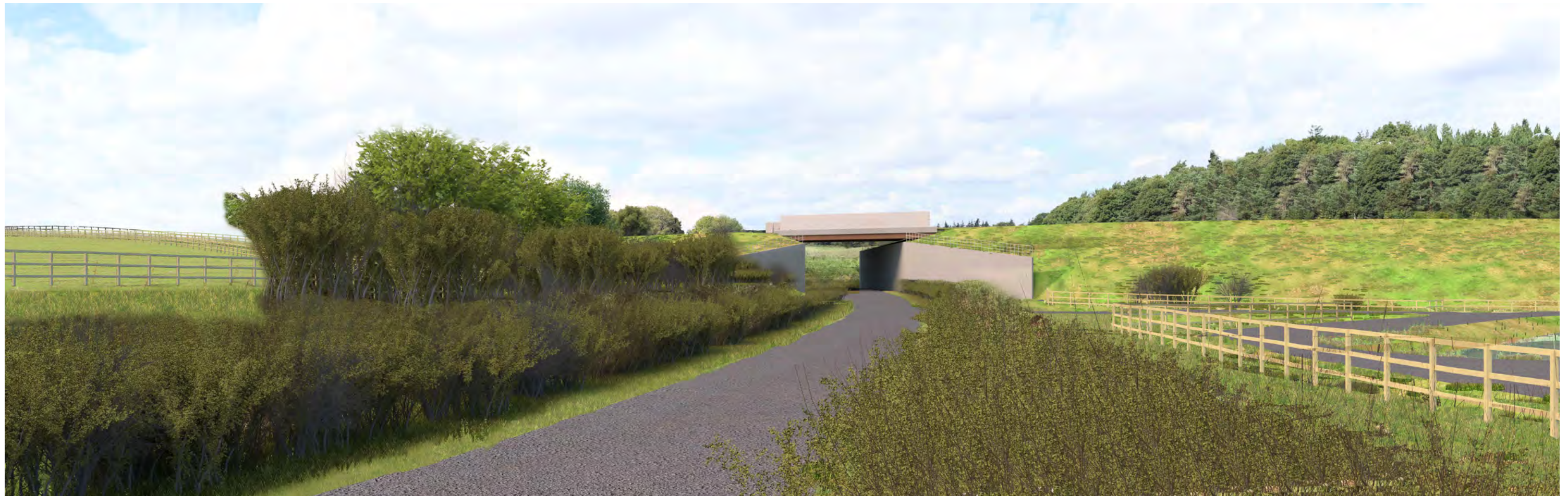
Zoom-in Extract, Recommended Viewing Distance at A3: 300mm