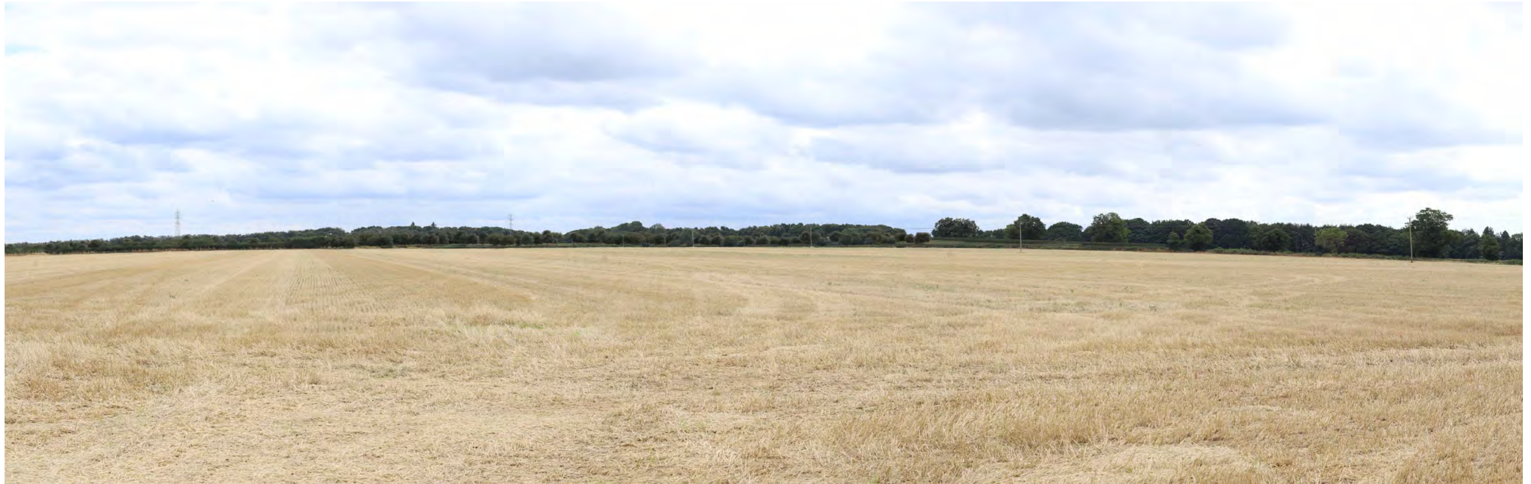
Zoom-in Extract, Recommended Viewing Distance at A3: 300mm