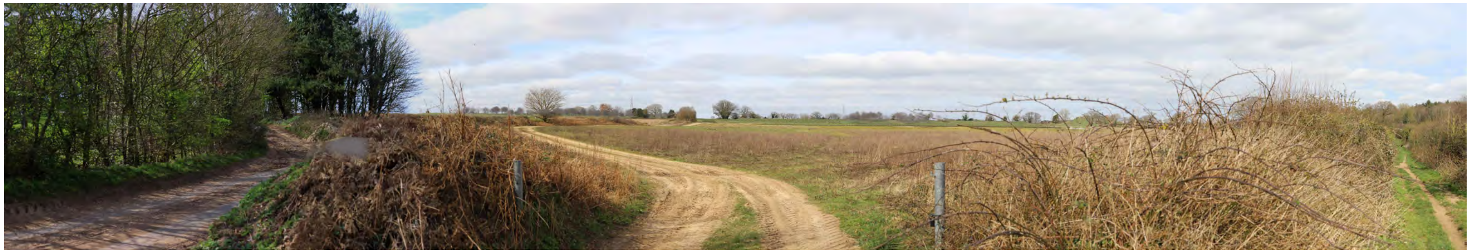
View 10: From Weston Road, looking north