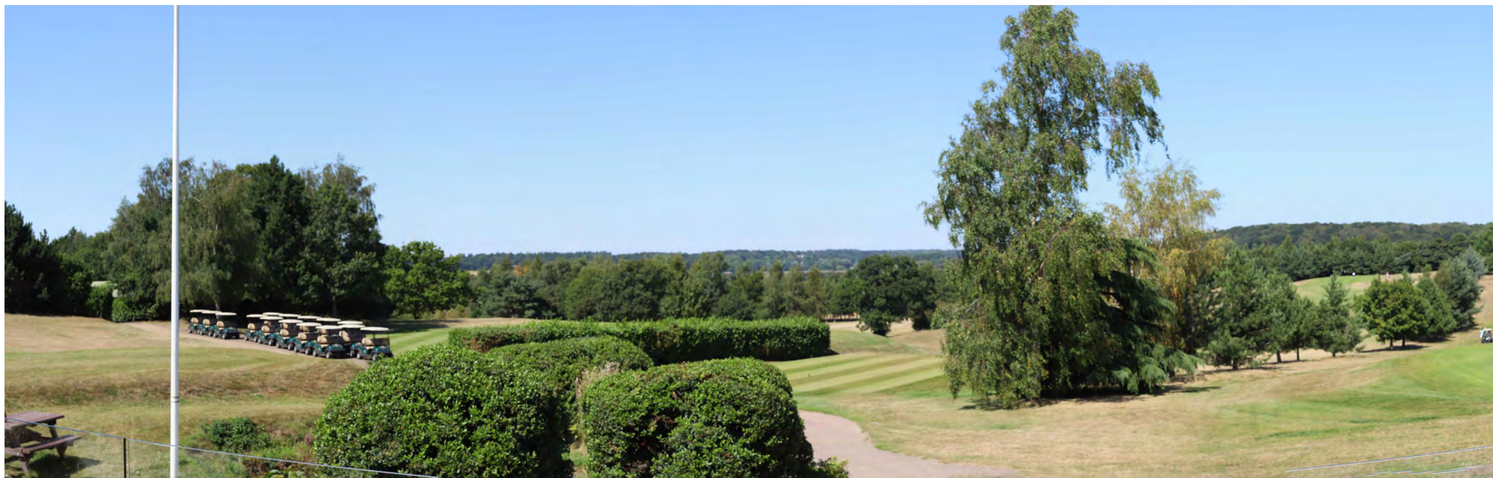
Zoom-in Extract, Recommended Viewing Distance at A3: 300mm