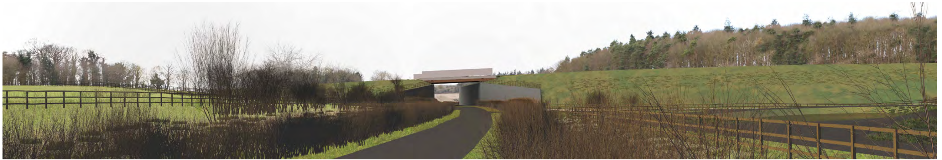
View 5: From Ringland Lane, looking west