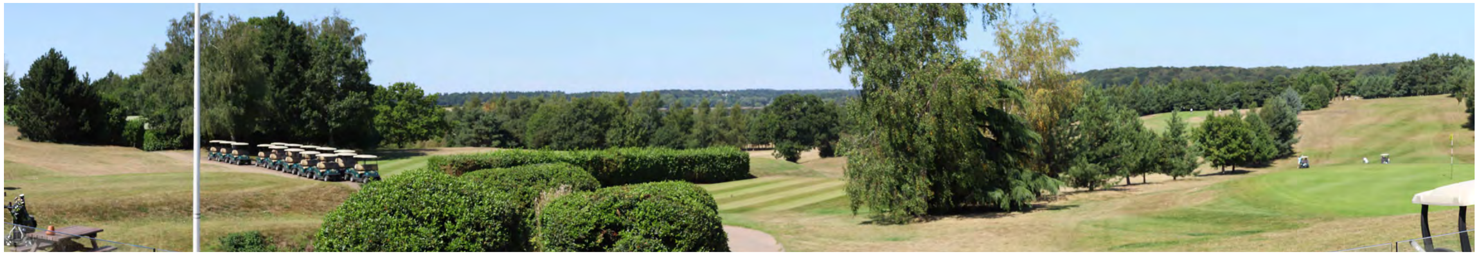
View 3: From Wensum Valley Hotel, Golf and Country Club, looking north