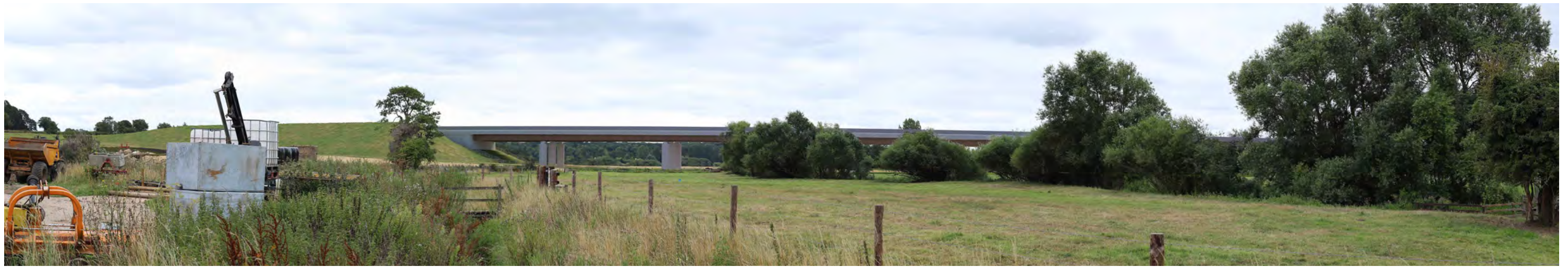
View 2: From Old Hall Farm on Fakenham Road, looking east