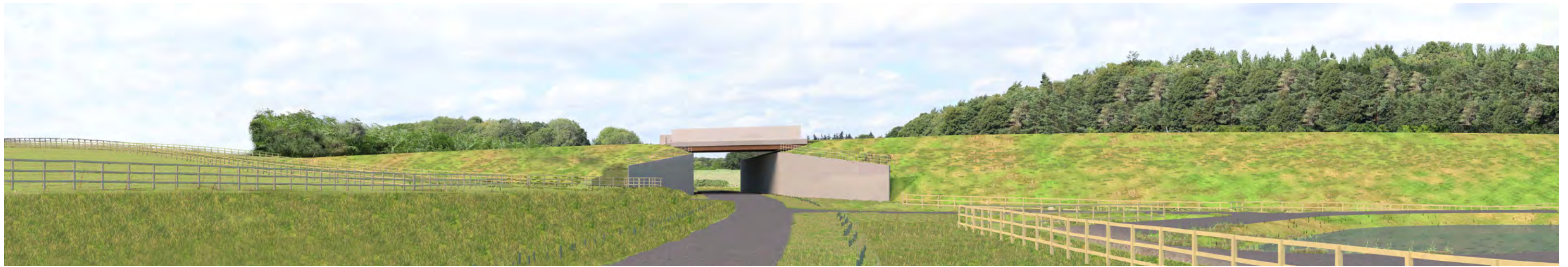
View 5: From Ringland Lane, looking west