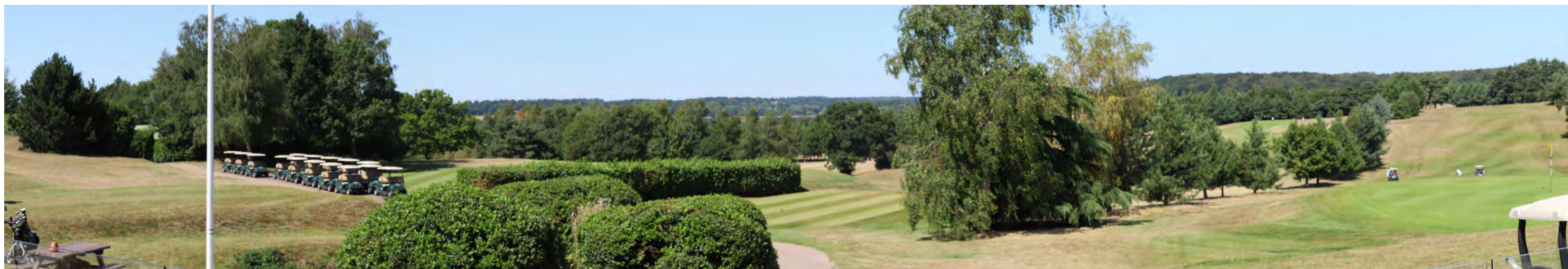
View 3: From Wensum Valley Hotel, Golf and Country Club, looking north