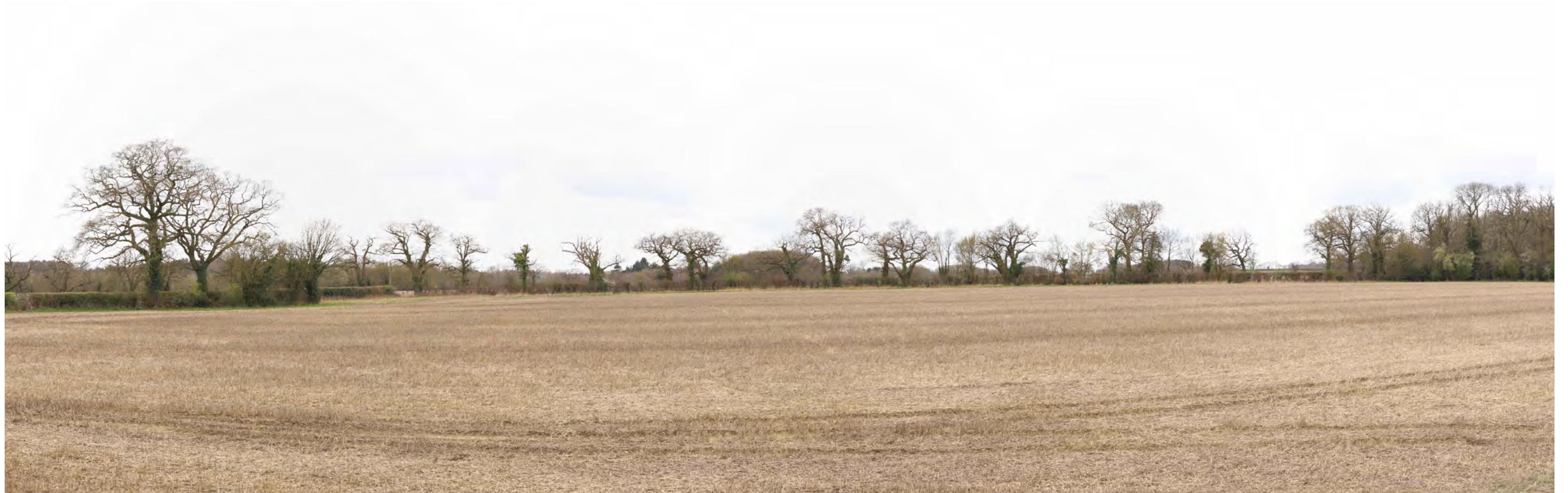
Zoom-in Extract, Recommended Viewing Distance at A3: 300mm